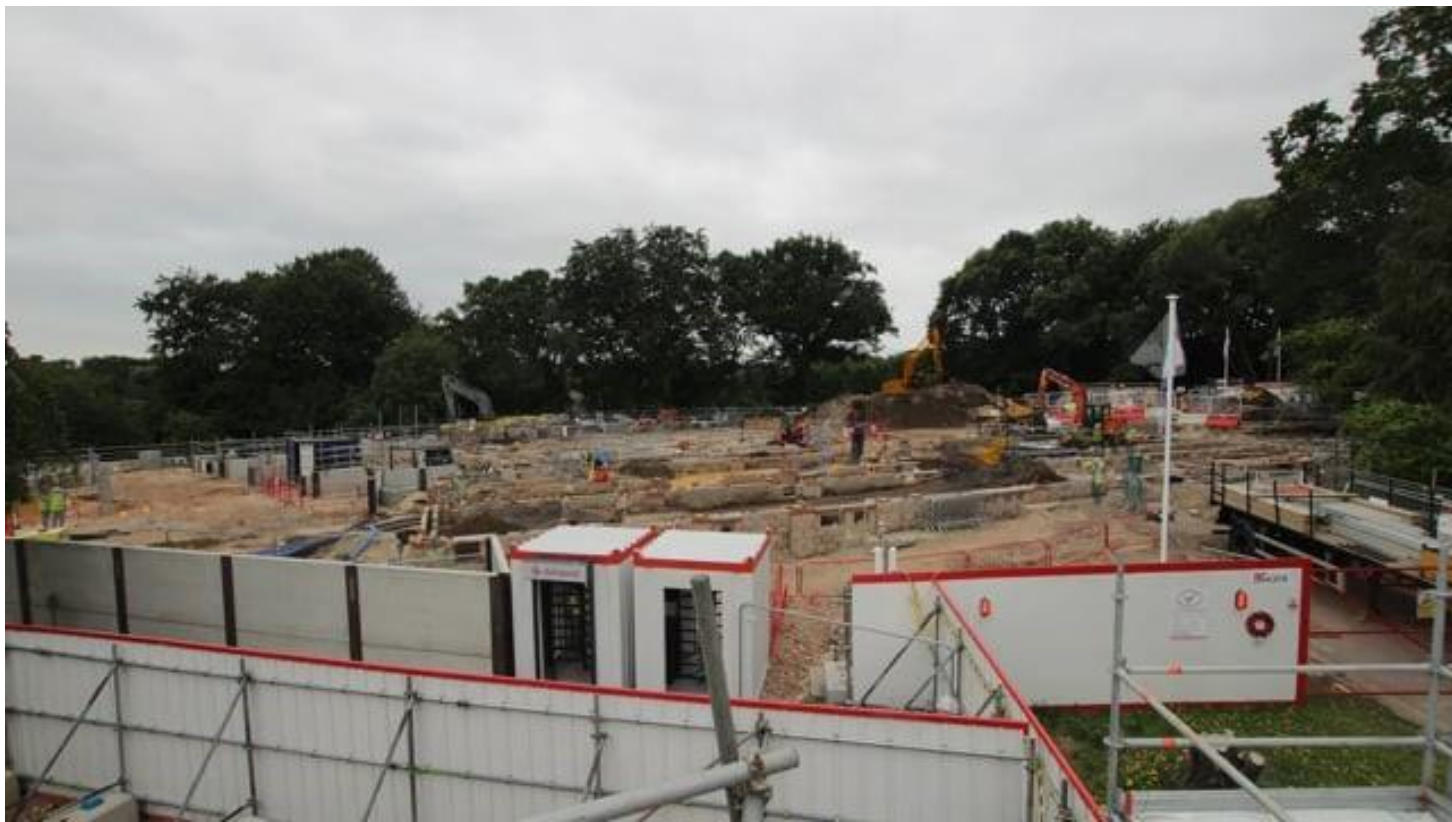
Progress video: July/August 2021