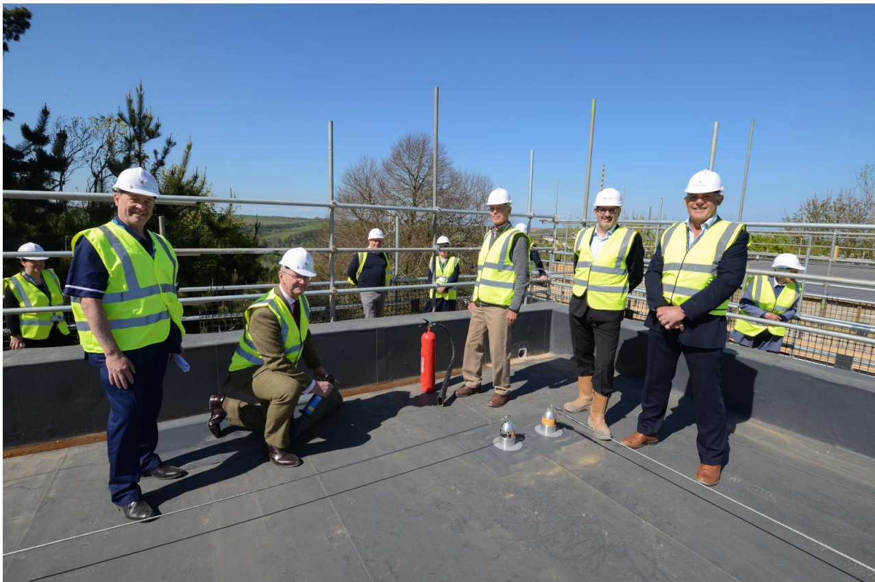
Topping out: Summer 2022.