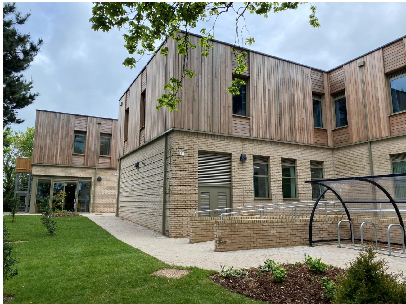
Garden spaces and courtyards, provide an attractive outdoor environment for users.