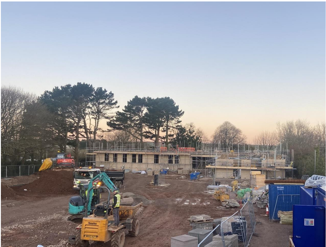
Development in progress: November 2021.