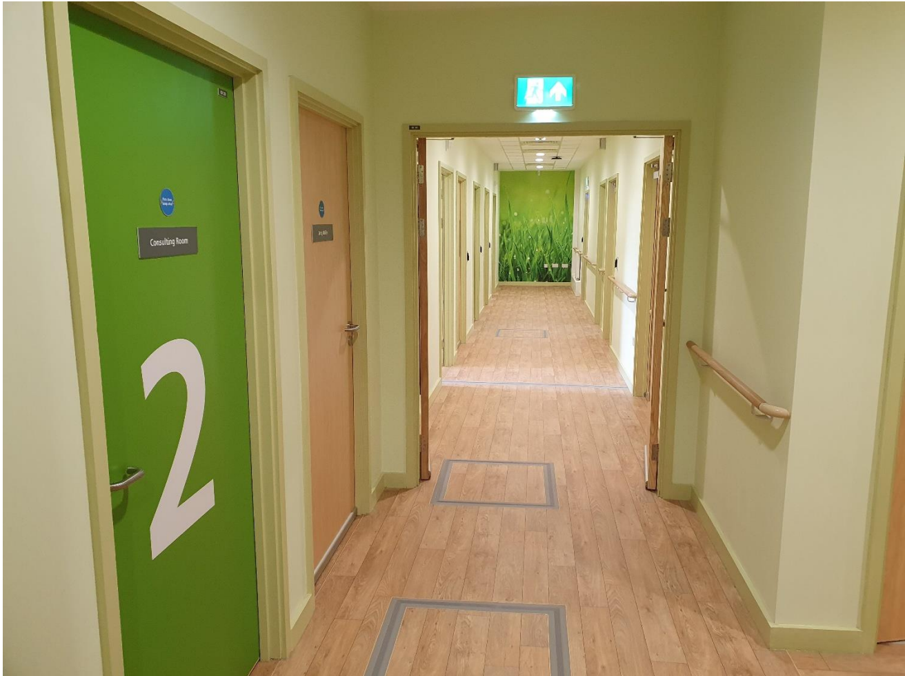
The new centre is fully accessible for all users, improving on previous GP buildings.