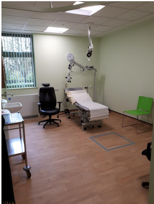
All rooms are NHS compliant size.