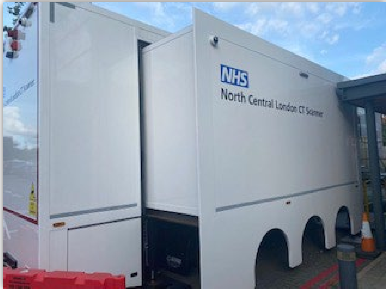
New external CT scanner