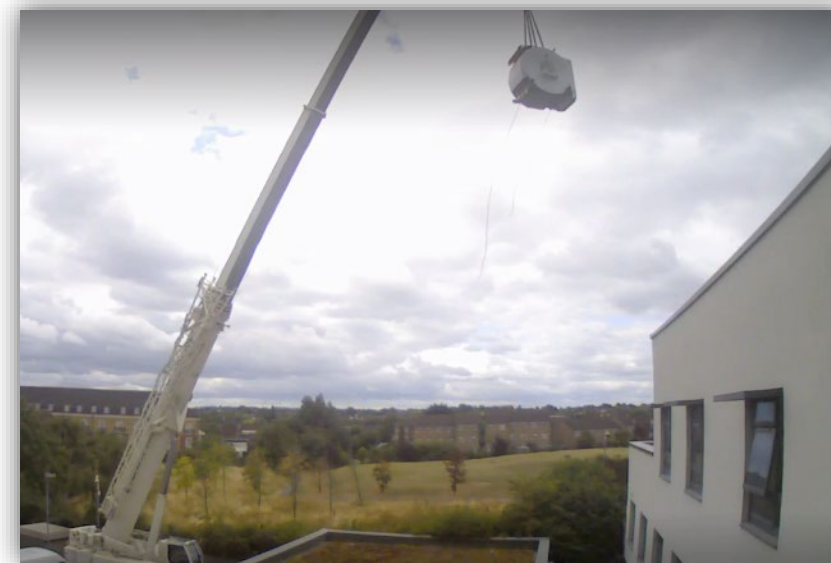
MRI 1 installation, August 2022