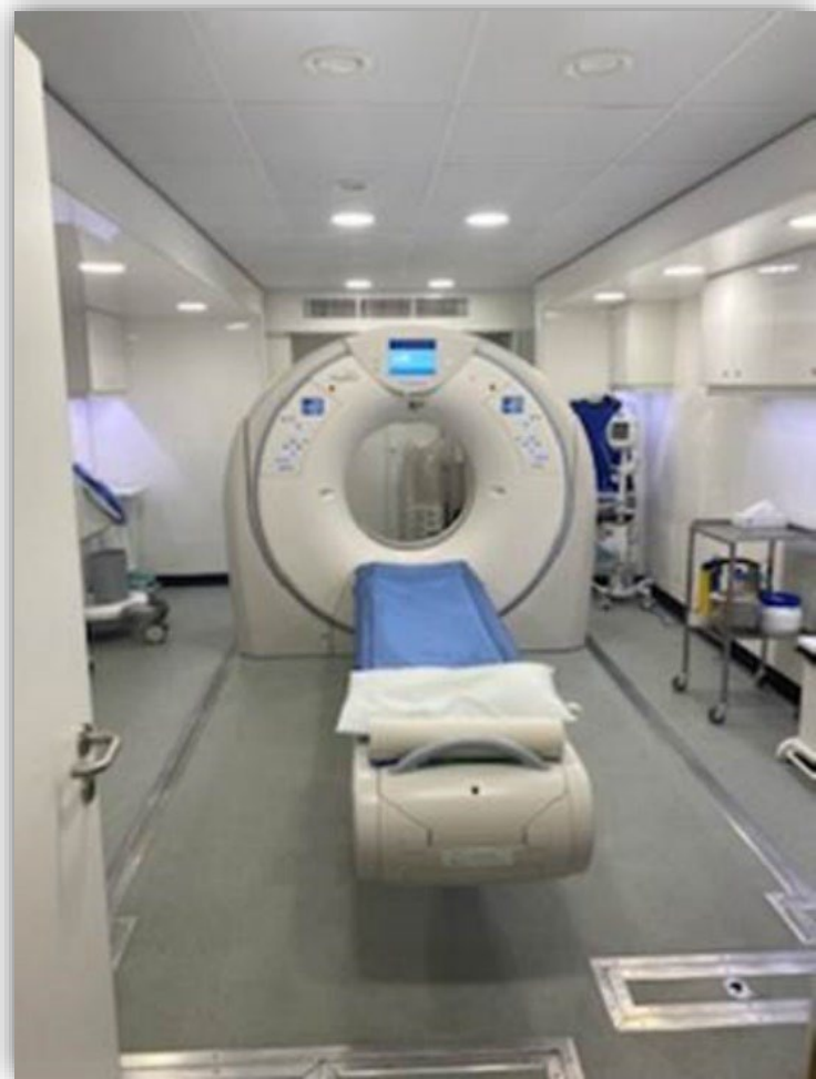
Inside the mobile CT scanner