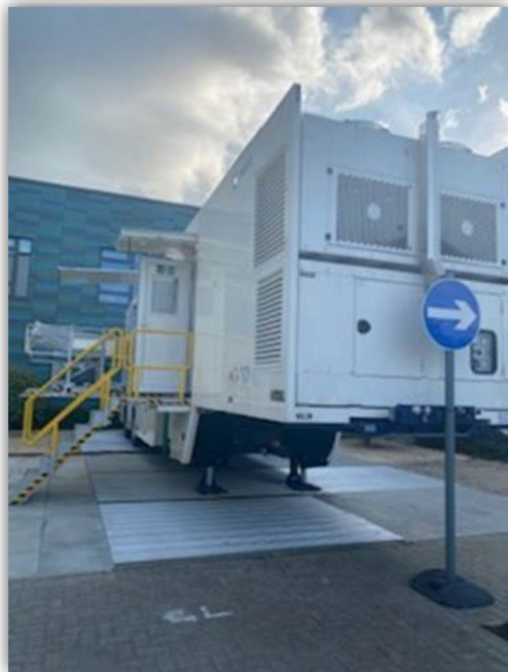
Mobile MRI scanner