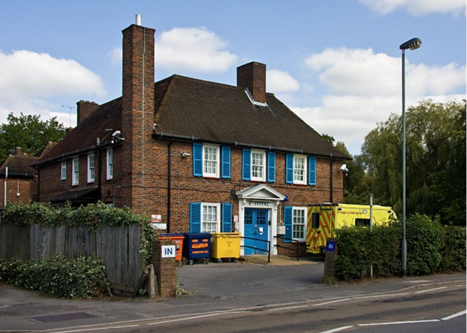
Current Northwood and Pinner Cottage Hospital