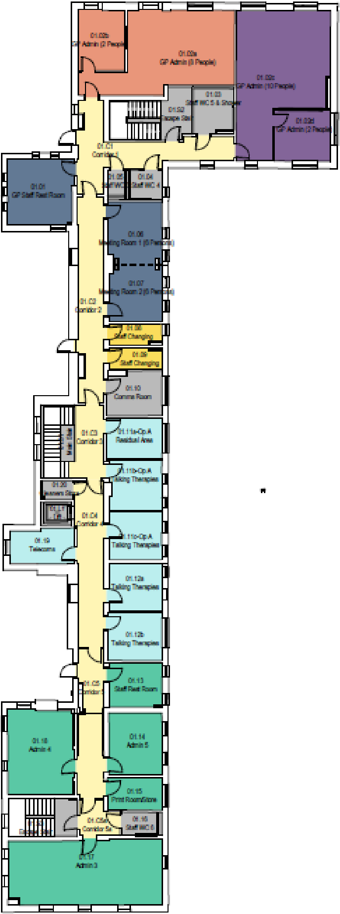
Floor plans, coloured by tenant and usage