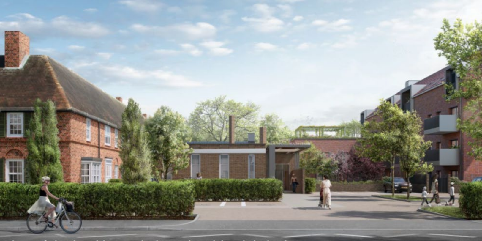
Design image for new development