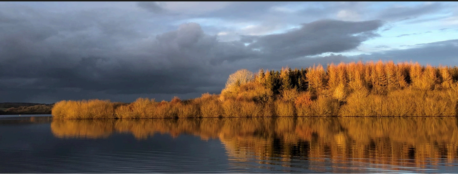
Photo Credit: Hugh Robinson, winner of gbp's staff 'tree' photo competition.