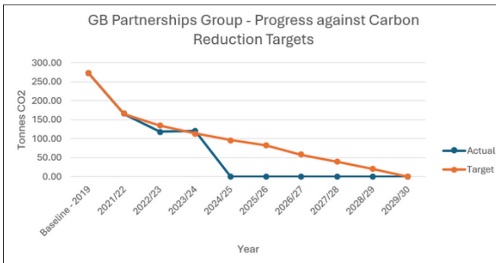
Chart: Group progress against carbon reduction targets

Progress against these targets can be seen in the following graph.