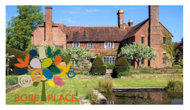
Commonwork Trust, Bore Place, Kent

Plus: Chailey Heritage Foundation, London's Air Ambulance, Royal Kingston District Scout Council, Wolverhampton University, Chaplaincy Christmas Appeal 2022. To read all of these stories , <u>click here.</u>