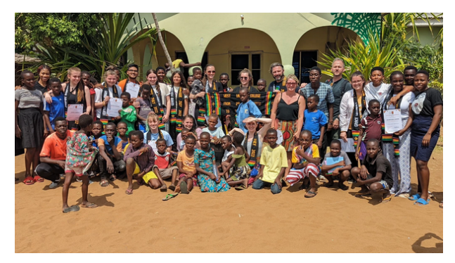
Woe School, Ghana