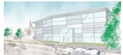
Artist impression of the new Weybridge H&WBC

Surrey Heartlands ICB has appointed gbp consult, via Hampshire Estates Partnership, to support with planning and delivery of a workshop for the occupiers of Weybridge Health & Wellbeing Centre which is currently in planning. The purpose of the workshop is to obtain a high-level overview of the key operational activities expected to be undertaken within the centre and test the functionality of the design against this overview. gbp manage are providing Project Management services for the project.