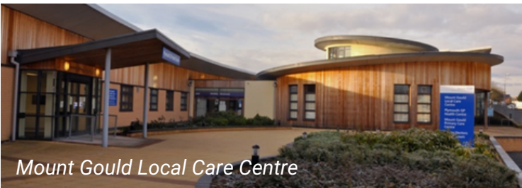
Mount Gould Local Care Centre

We are delighted that the recommendations from our analysis are now becoming a reality, with Financial Close reached to enable the £6.9m reconfiguration project at Mount Gould LCC to commence, which once complete, will accommodate the Plym Neuro Rehabilitation Service.