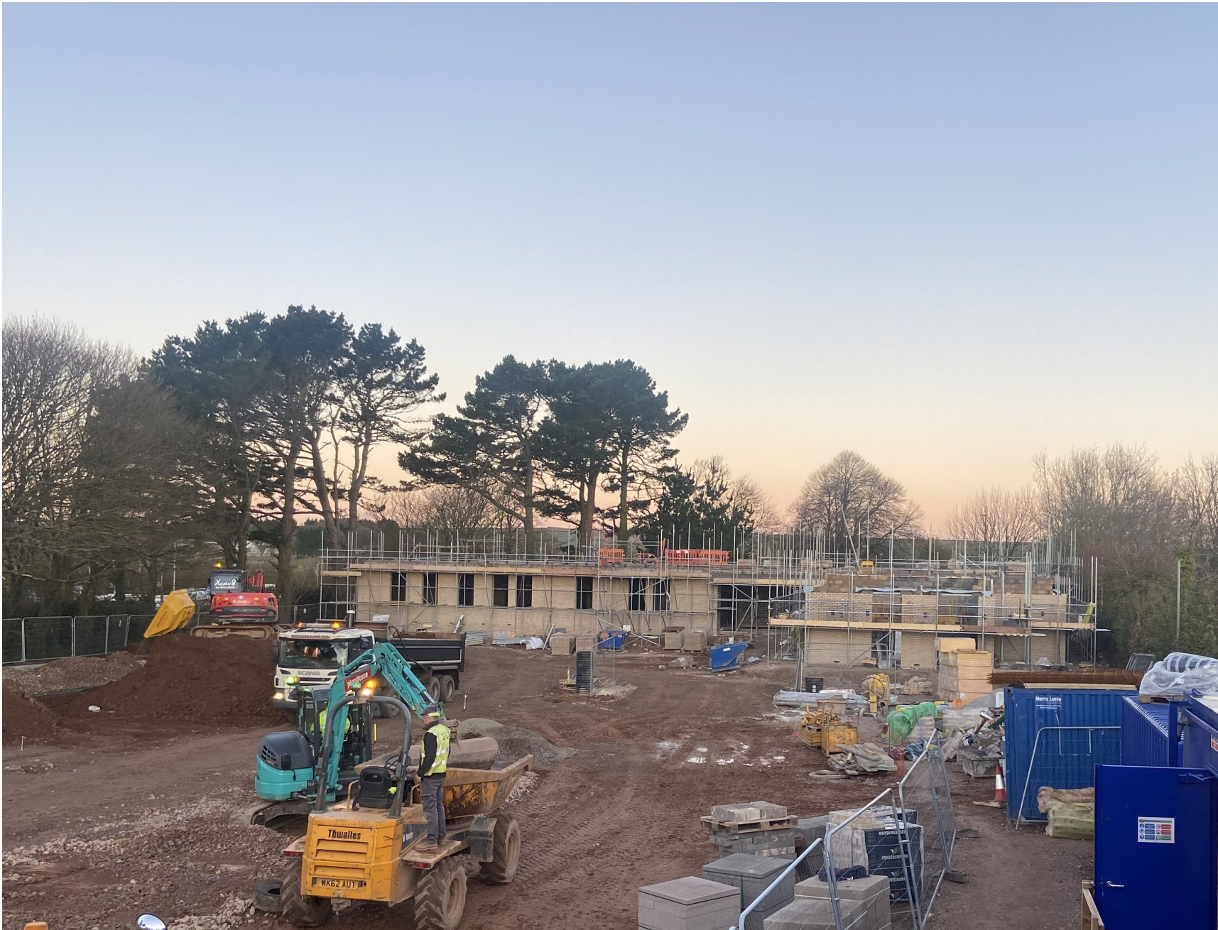
Development in progress: November 2021