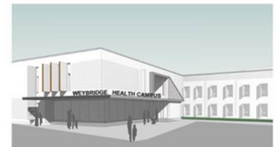
Artist impression of the new Weybridge H&WBC.

Surrey Heartlands ICB has appointed gbp consult, via Hampshire Estates Partnership, to support with planning and delivery of a workshop for the occupiers of Weybridge Health & Wellbeing Centre which is currently in planning. The purpose of the workshop is to obtain a high-level overview of the key operational activities expected to be undertaken within the centre and test the functionality of the design against this overview. gbp manage are providing Project Management services for the project.